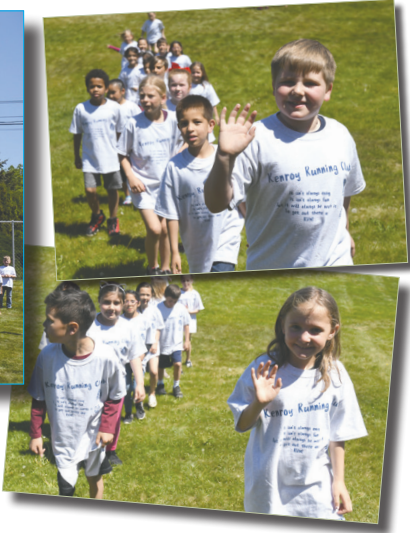
Three years in, 475 students are participating in this twice weekly running club. Staff members say it's greatly reduced the number of disciplinary actions at Kenroy in an average week..