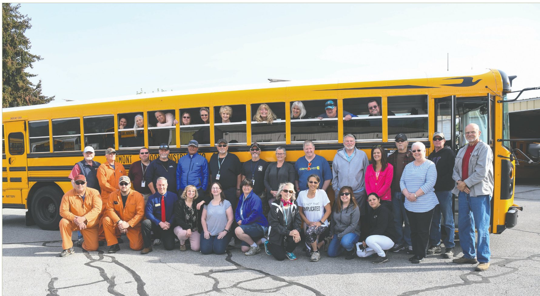
Eastmont School District Transportation Department staff members posing for a group photo this spring. Staffed by a dedicated group of about 40 Eastmont employees, they take their duties to safely transport our community's most precious cargo very seriously.

The administrators, bus ramp supervisors, and students at Eastmont Schools would like to give a huge shout-out to our Eastmont bus drivers and the entire transportation department for the amazing job they do getting our students to and from school and activities each and every day! We appreciate their consistency in going above and beyond to support the students they have in their care each morning and afternoon! It is with great sincerity that we say: "Thank you for ALL you do!"