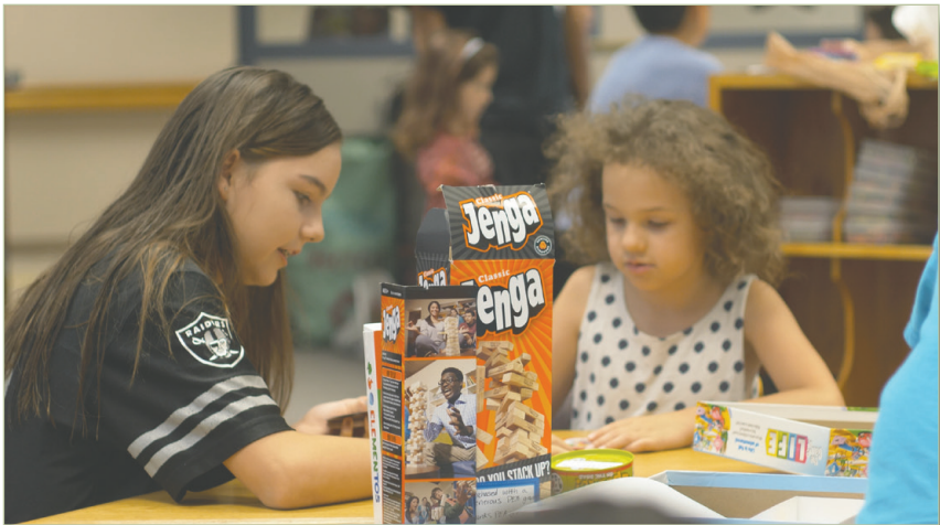
Two summer library program patrons play a game at Rock Island Elementary, July 2018.

Wednesdays at Rock Island Elementary School, 12-2:00 P.M.