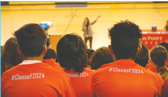
Watch a video recap of the kickoff event at Clovis Point on our YouTube channel.